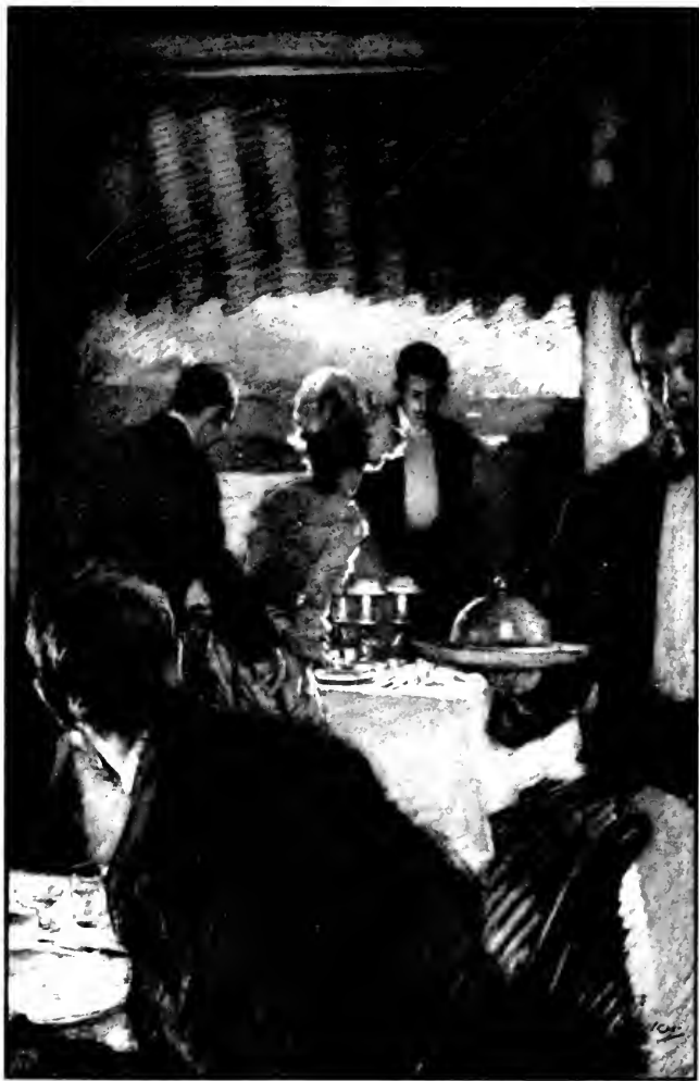
It is here that he was sitting